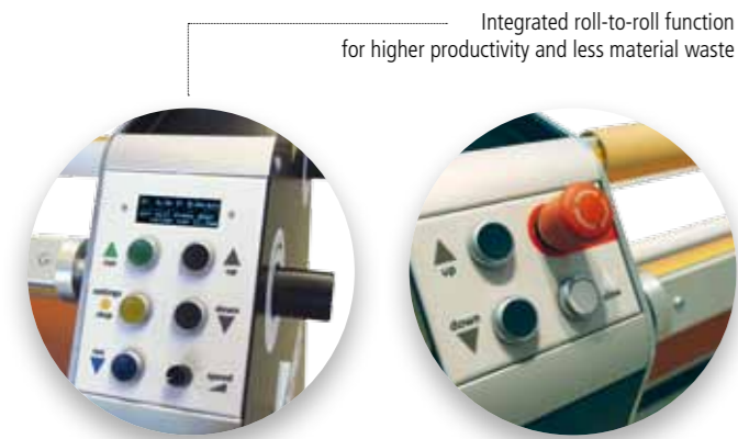
Integrated roll-to-roll function for higher productivity and less material waste